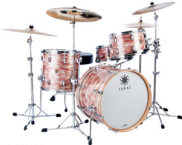
PINK OYSTER PEARL